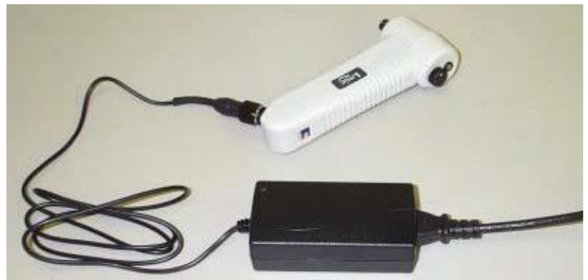
Figure 3. The Lmic connected to the universal 110-240V AC charger.