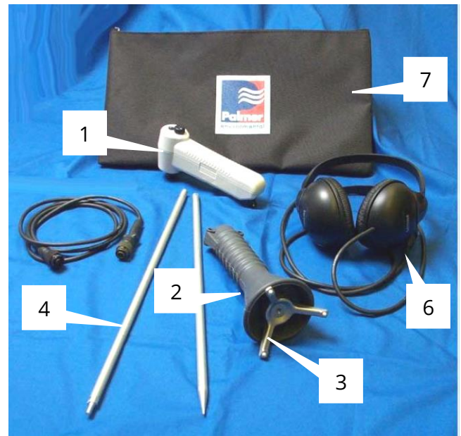
Figure 1. Lmic equipment. (Battery charger not shown)