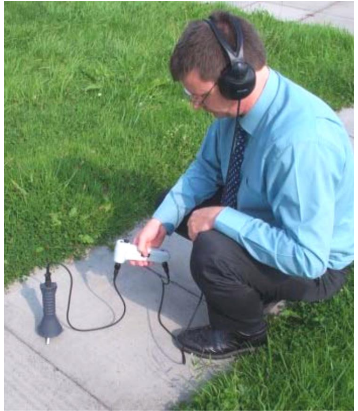
Figure 2. The Lmic in use

Connect the charger lead to the rear connector of the Lmic and connect the charger power lead to the AC supply. The Lmic can then be charged overnight. An optional accessory is the car cigarette lighter adapter that can also be used to charge the batteries.